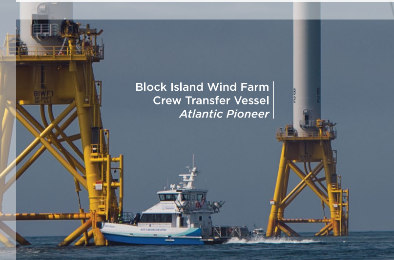
Block Island Wind Farm Crew Transfer Vessel Atlantic Pioneer

Phone: 401.954.2902 Email: rifisheryliaison@gmail.com